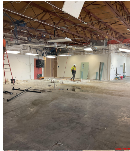
Finalizing cafeteria demo, removing plumbing vent pipes and supply lines