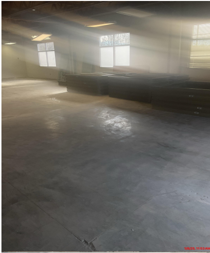
Door frames received