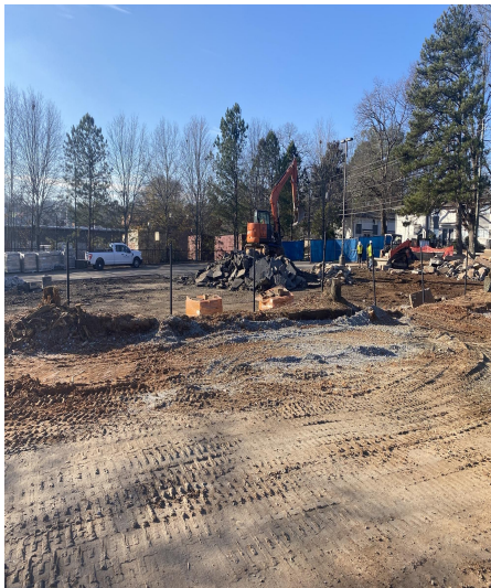
Demolition of front entrance parking area