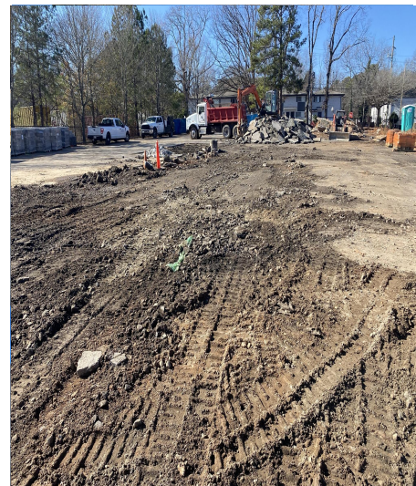
Asphalt being hauled off